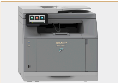
Standard desktop configuration.