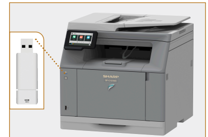
Front USB port for easy direct printing from memory devices.