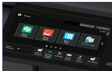
Easy-touch display with customizable menus.