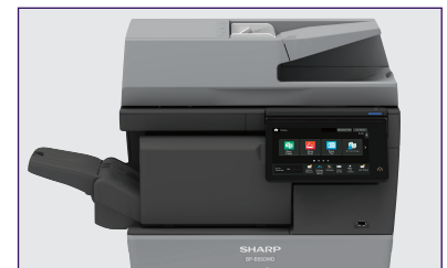
Optional compact inner finisher offers stapling, offset stacking and sorting.