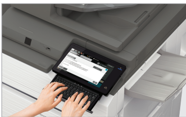
Built-in retractable keyboard simplifies email address and subject line entries.