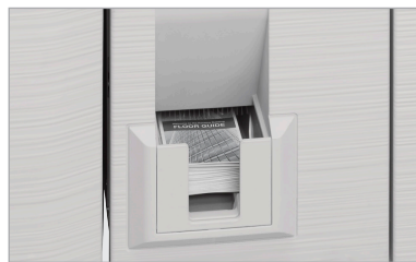
Folding Unit option offers a variety of fold patterns, including tri-fold, z-fold and others.