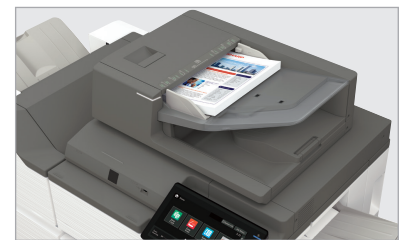
High capacity 300-sheet DSPF scans documents at up-to 280 images per minute.