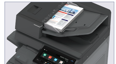
High capacity 300-sheet DSPF scans documents at up to 300 images per minute.