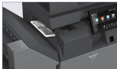
New Inner Folding Unit option offers a variety of fold patterns, including c-fold, z-fold and others.