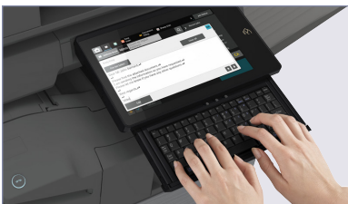
Built-in retractable keyboard simplifies email address and subject line entries.