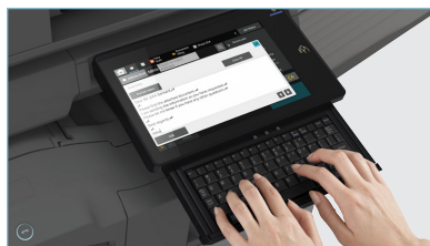
Built-in retractable keyboard simplifies email address and subject line entries.