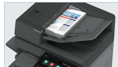
High capacity 300-sheet DSPF scans documents at up to 300 images per minute.