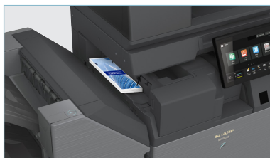
Inner Folding Unit option offers a variety of fold patterns, including c-fold, z-fold and others.