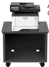
Adjustable Stand (optional)

*Some features of SRDM are not available.