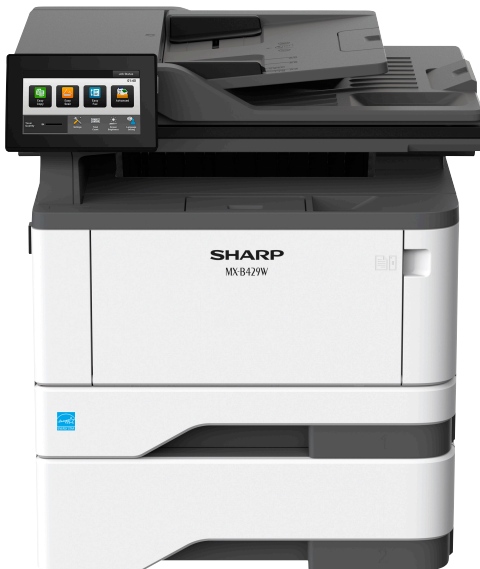
MXB429W shown with 2-drawer paper deck.