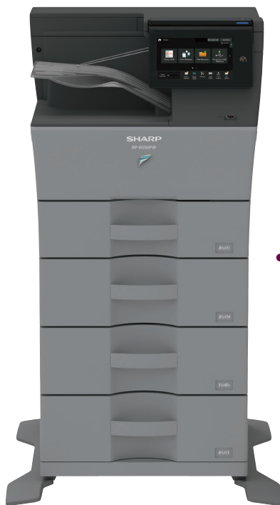
BPB550PW Monochrome Printer

Merging technology and functionality Versatile printers designed to elevate productivity.