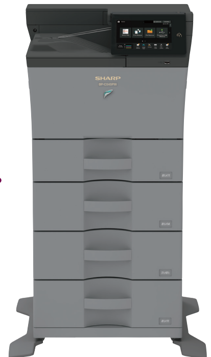
BPC545PW Colour Printer

Paper drawers feed up to 8.5" x 14" paper and support media up to 220 gsm (80 lb. cover). Supports up to 2,350 sheets in paper drawers and bypass tray with options.