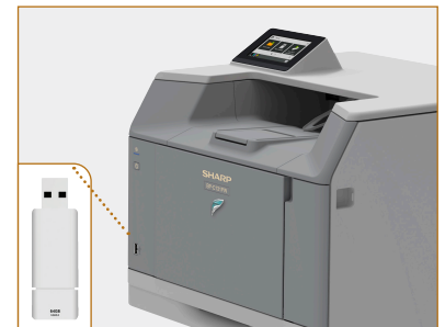
Front USB port for easy direct printing from memory devices.