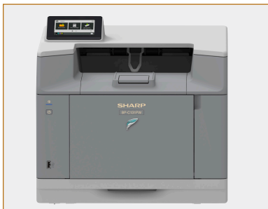
Standard desktop configuration shown.